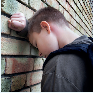
Welfare for children, youth and families