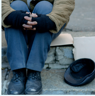
Support for the unemployed, for the homeless, for the heavily indebted, and for other poor people in society