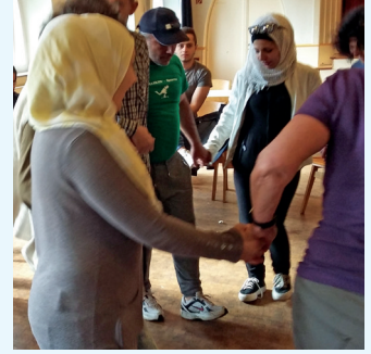
Support for migrants and refugees, especially when discriminated against