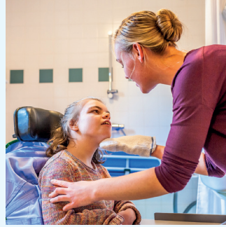
Aid for handicapped people