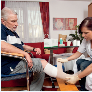
Care for old people