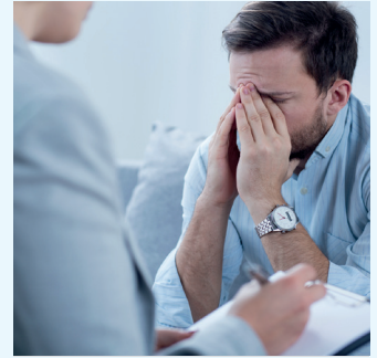
Care for the sick

In-patient service units, outpatient units, as well as day services and individual care for a person – all that is within the range of offerings provided by Diakonie.