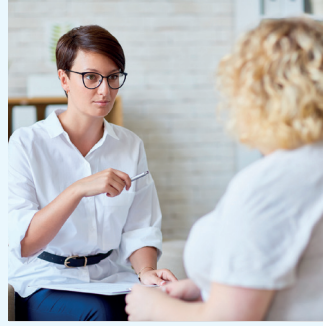
Support for girls and women in distress