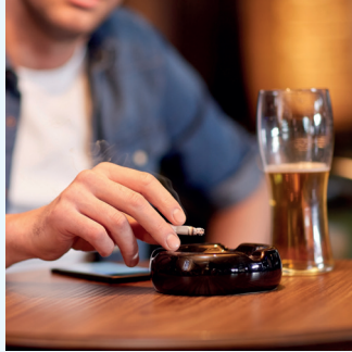
Support for drug addicts and those at risk